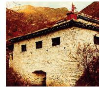
The "Temple Of Miraculous Fire" at Muktinath, Nepal. Photo by Ken Street (November 1979).

[For more on this subject, please read our tract The Temple Of Miraculous Fire. ]